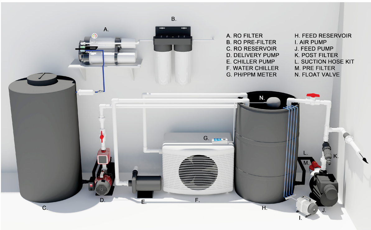
Below - A more complex Reservoir / Water Management example.